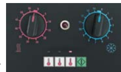
Front Cover: MD120 To Right: MD75 Far Right: MD330

Many MAXI dryers are available with simple dual timer controls for drying time and cooling time. A push-to-start switch is a standard safety feature, and a pilot light indicates when the dryer is operating.